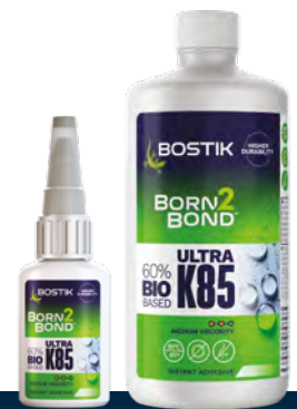
ULTRA K85 - MV